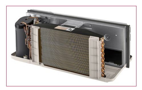
GoldFin™ Anti-corrosion Treatment