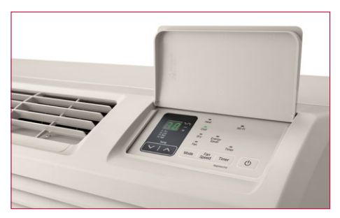
ADA Compliant, Easy-to-Use Digital Control Display